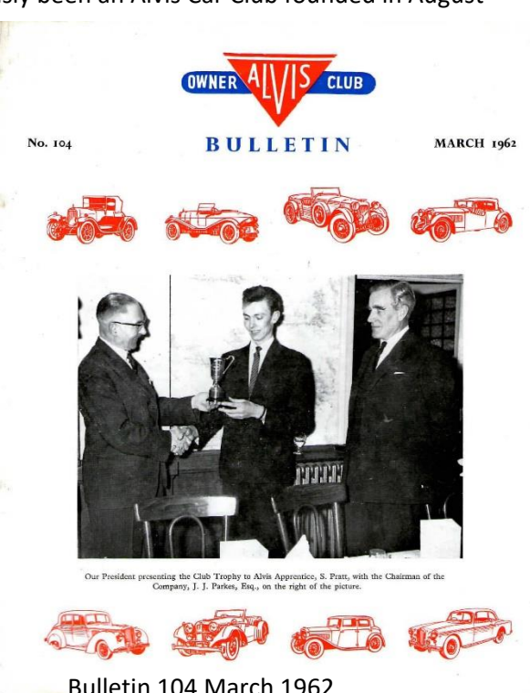
Bulletin 104 March 1962

Until 2000, the Club was constituted as a members' club. At that time, this decision was taken to incorporate the Club as a company limited by guarantee, as with many other similar car clubs.