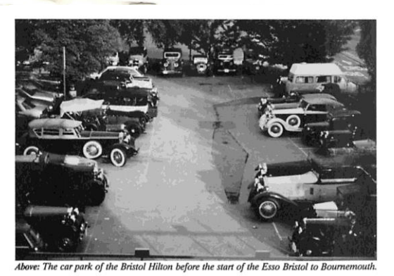
Bulletin 386 August/September 1990