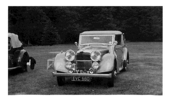
Ron Buck's well-known Speed 25.