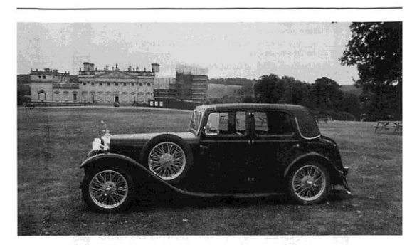
Mick Fletcher's Firebird in front of Harewood.