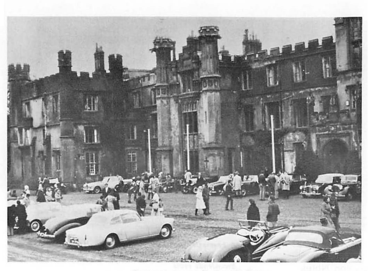
Concours area at Knebworth House